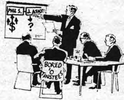
"And the secret zebra account is channeled through the..."