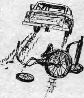
"Subject Gone Upon Arrival"