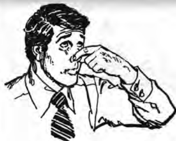
"Does this look okay?"

"Conversation," he whispered. "You see, although money and status are their true gods, by embracing American fundamentalist Christianity they have also adopted that sect's peculiar cultural beliefs—including its racism. Now, you will never get these people to admit that they are greedy, shallow dullards—