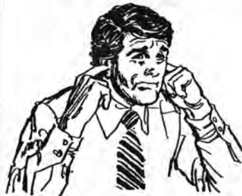
"That's gonna cost a lot."