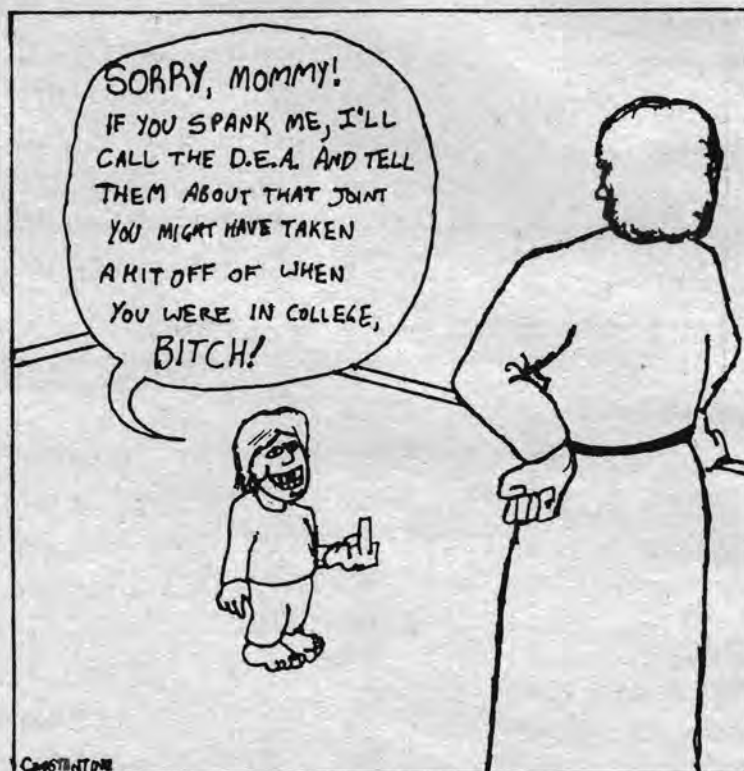
GEORGE BUSH'S WET DREAM- TURNING INTO REAL LIFE!

BRUGHT TO YOU BY THE PARTNERSHIP FOR A NON-ORIENTAL AMERICA.