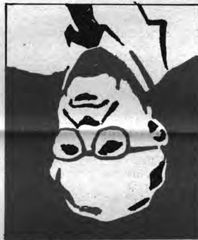
Solution To Puzzle Page 7

Circulation: 5,000 Cost: Distributed free to UT Students or $1 by mail in plain brown wrapper If you or someone you love would wish to support the Lame Monkey through advertising, we have reasonable rates. Write: P.O.Box 8763, Knoxville, TN 37996-4800 or Call 637-4840 and leave a message.